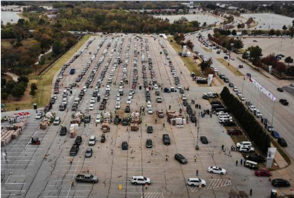
Food Banks Strained During COVID-19 Pandemic