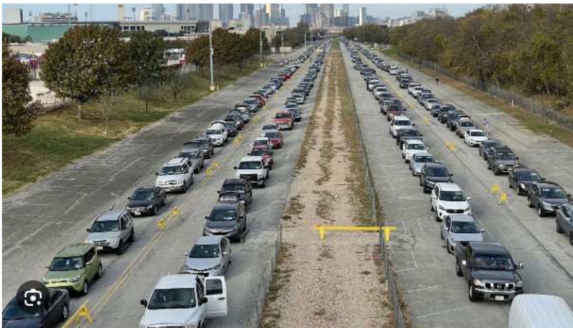
Thousands of cars form lines to collect food in Covid-hit Texas