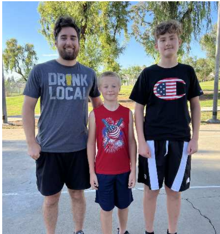
“Big Mike” is the short one! Quite the picture, eh? ☺