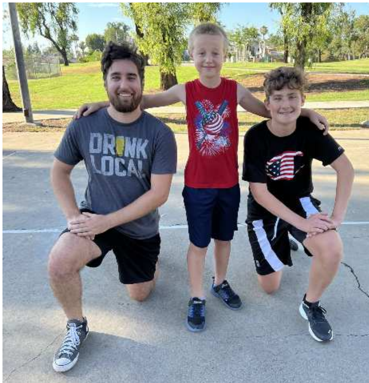
Ah! Now he’s grown and we see who’s really in charge!