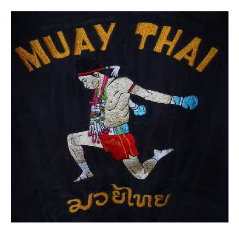
Beautiful Muay Thai embroidery on the back of one of his jackets. Very cool!