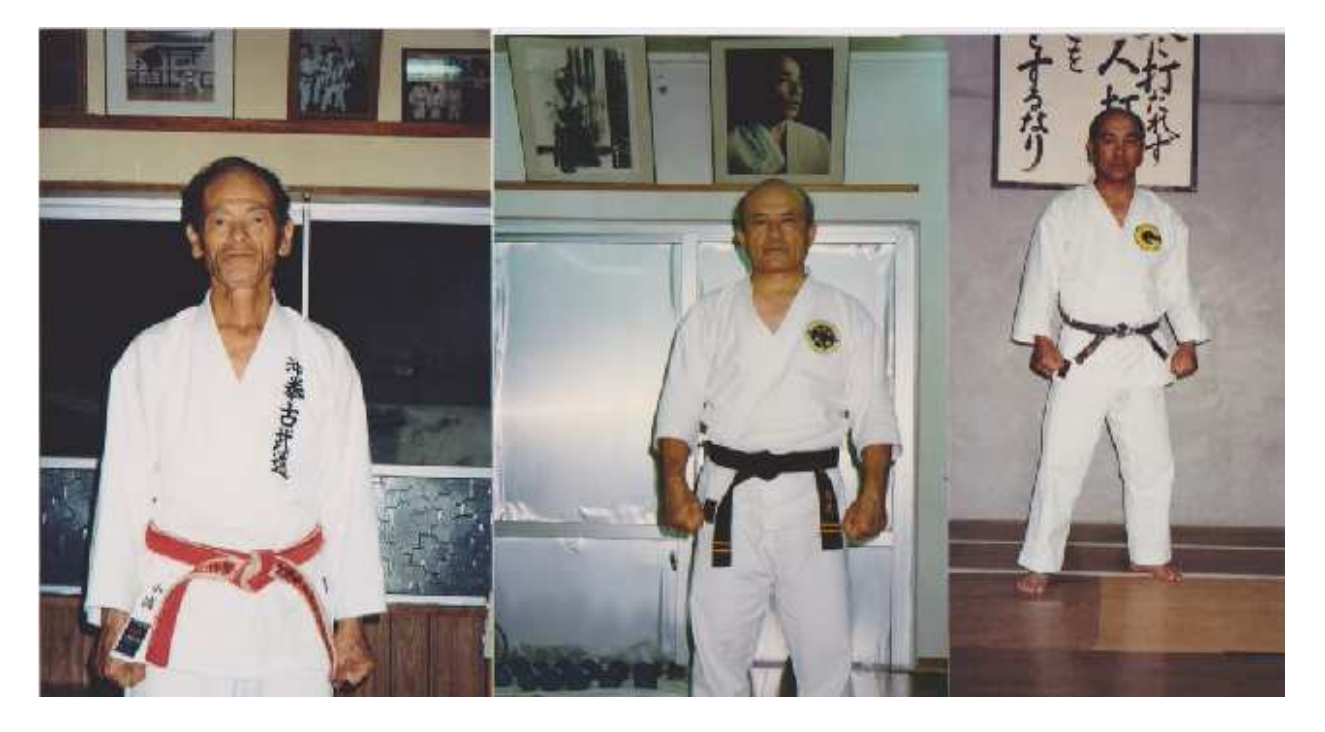
Three of his martial arts teachers from different systems