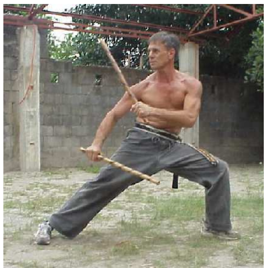
Right out of "Central Casting." Practicing Filipino stick-fighting, i.e., escrima