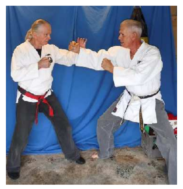
Two longtime dear friends . . . and thankful to be so.