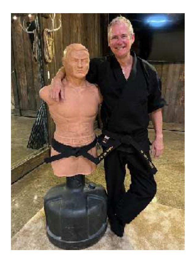
Shared happiness for a job well done!