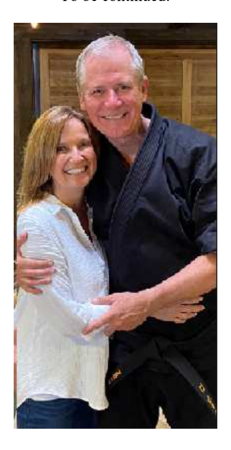
The Karate Institute of America ^{\rm tm} and Kiado-Ryu ^{\rm tm} Martial Arts.