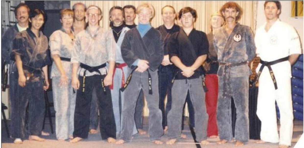
These distinguished individuals were the soul and substance of the first wave of Black Belts of the Kiado-Ryu during the Eighties and early Nineties.